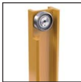
Truck with radial bearings