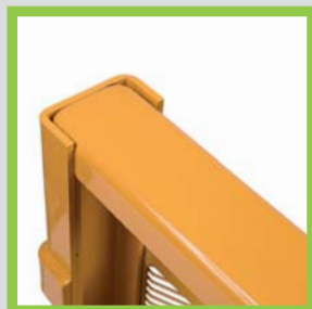
Bent steel profiles